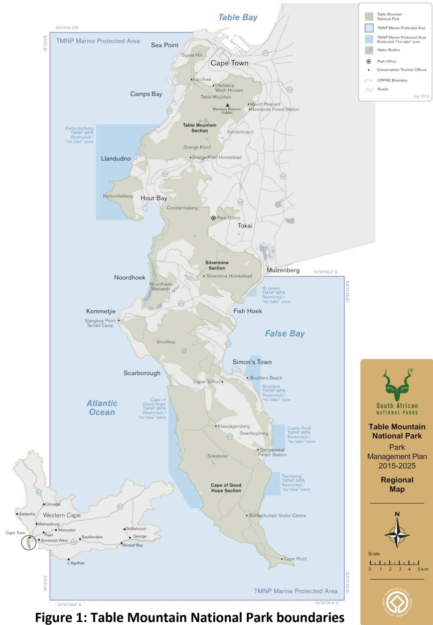
Figure 1: Table Mountain National Park boundaries

TMNP is still in the process of land consolidation and at this stage is not a continuous unit but is fragmented by urban development and other public managed land. It is divided into three management areas (Figure 1):